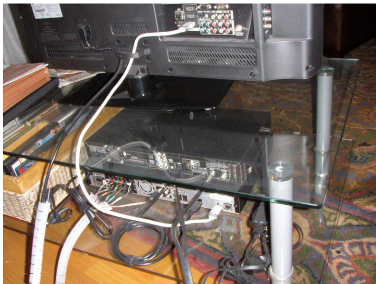
This view shows the backs of all the components, with excess cord lengths bound by Velcro ties.